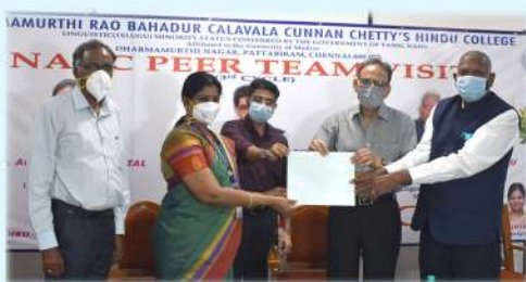
NAAC Peer Team