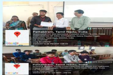
Yoga and Meditation