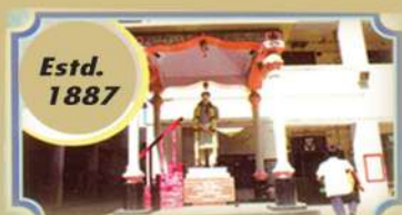
Dharmamurthi Rao Bahadur Calavala Cunnan Chetty's Hindu Higher Secondary School (Aided), Tiruvallur – 602 001.