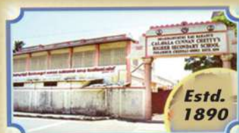
Dharmamurthi Rao Bahadur Calavala Cunnan Chetty's Higher Secondary School (Aided), Perambur.