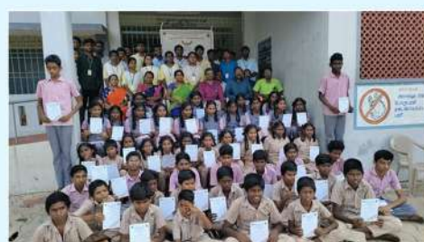
Community Education Programme