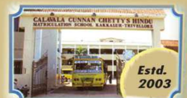
Calavala Cunnan Chetty's Hindu Matriculation Higher Secondary School (Self Financing) Kakkalur, Tiruvallur.