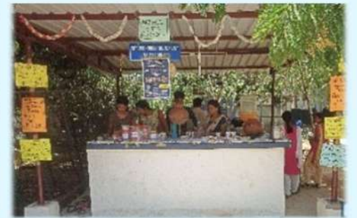
ED Cell Counter